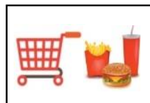
STORES AND RESTAURANTS