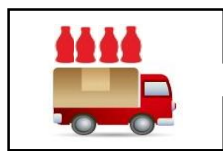
MANUFACTURER & DISTRIBUTOR